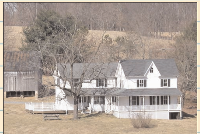
The farmhouse pictured here would be the main facility for Teen Factor upon some renovation inside.

Since Teen Factor became incorporated in 2004, the long-term vision has always been to operate a group home to meet the needs of at-risk teens. The opportunity to make that vision a reality is here. After much prayer and beginning the due diligence process, the Board of Directors unanimously approved placing an offer on land in Ijamsville, Md.