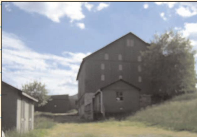
Shown here is one of the barns and the garden shed just past the main farmhouse.

Although the home is not in mint condition, it has tremendous potential to meet the needs of Teen Factor. This is where your help is needed.